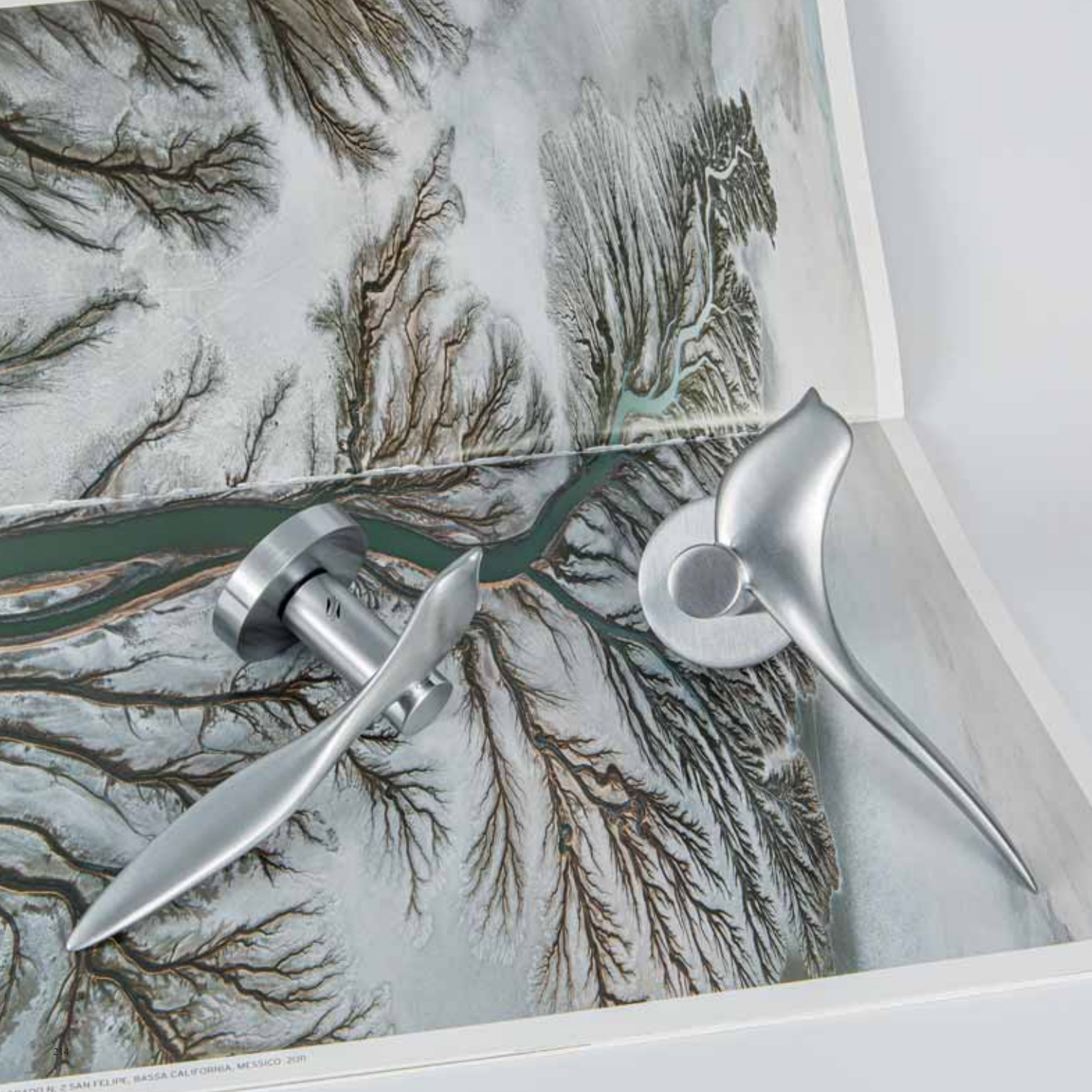
PARADO N. 2 SAN FELIPE, BASSA CALIFORNIA, MESSICO, 2011